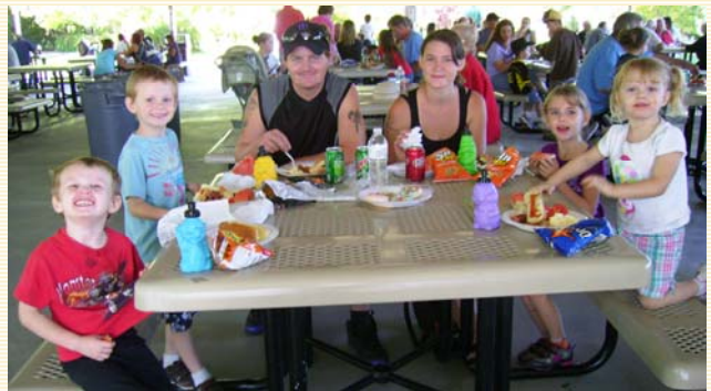
Above: A family enjoys the meal provided by Scottish Rite Masons