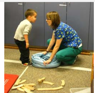
Above: RiteCare child and therapist interacting.

Memorial Pediatric Rehabilitation is proud to announce our new program for children with autism and other developmental disorders using the DIR® Floortime® approach. This approach focuses on helping children with autism progress through the functional emotional developmental milestones by recognizing the child's individual differences and building relationships. Through play, therapists help children build healthy foundations for social, emotional, and intellectual capacities by pulling them into meaningful social interactions with others. Currently the program is run by Floortime®-trained speech therapist and occupational therapist.