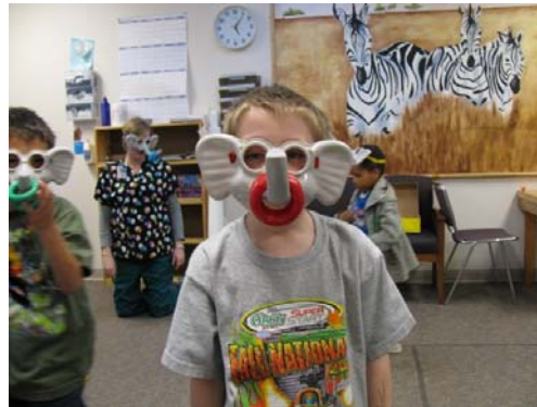
Left: Children enjoy one of the many fun summer themes during a group therapy session at the Memorial Pediatric Rehabilitation RiteCare clinic in Colorado Springs.

Memorial Pediatric Rehabilitation has recently completed another round of our summer speech and language groups. Groups consisted of about four children each, with children being matched by age, skill level, and areas of concern.