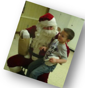
Children receive a new book during the week of Christmas at Children's Speech and Reading Center in Ft. Collins!