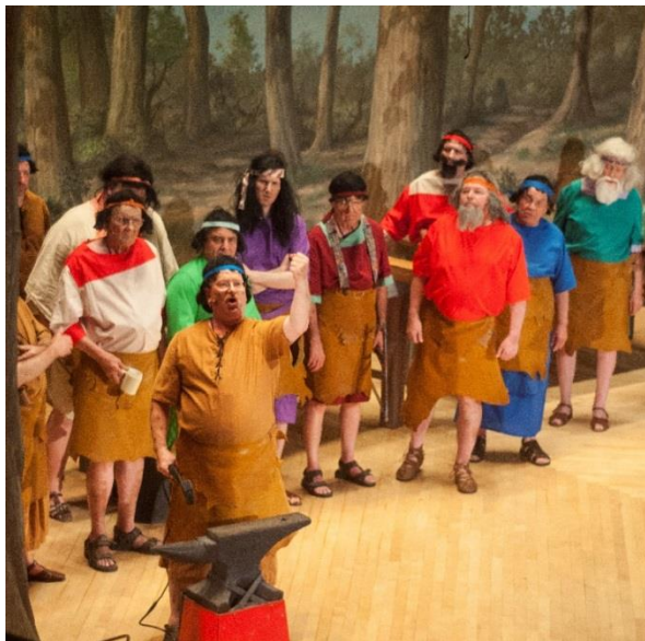
Cast performing “The Carpenter’s Workshop”