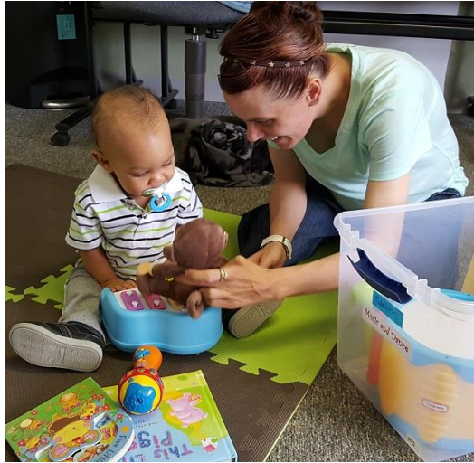
Mother and Child