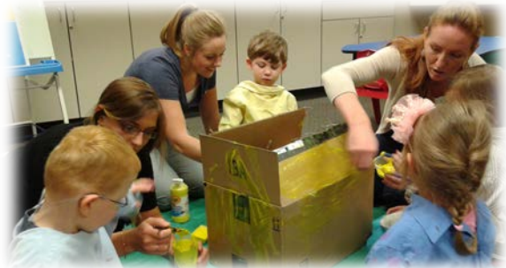
Above: UNC Students support the RiteCare preschool children during a hands-on project.

The graduate clinicians that lead the Talking and Listening for Preschoolers Program (TALP) at the University of Northern Colorado (UNC) would like to thank the Scottish Rite Foundation for the opportunity to expand our clinical experiences. This program benefited our education in numerous ways. By working with children within a group setting we were able experience a dynamic atmosphere while collaborating with fellow clinicians and clinical supervisors. We became proficient at creating activities and materials to cater to a wide range of children’s abilities. We encountered instances that challenged us to manage behaviors and we found positive ways to maintain a child’s focus throughout the sessions. We are grateful to the Scottish Rite Foundation for their support of the TALP program at UNC and for expanding the clinical experiences offered to the graduate students at our University.