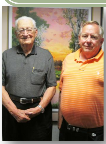
Page 9 of 11

The Grand Junction community established a RiteCare program with The Scottish Rite Foundation of Colorado in 1986. Celebrating 27 years of partnership this year!